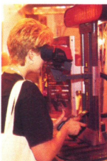
Virtual Boy was still keeping its head above water with new titles such as Dragon Hopper

GamesMaster which is wearing surprisingly well considering three similar shows. Bad Influence, Total Reality and Reactive have been taken off the air. Dexter Fletcher did try to kill off the show two seasons ago by being agonisingly unwatchable. He failed