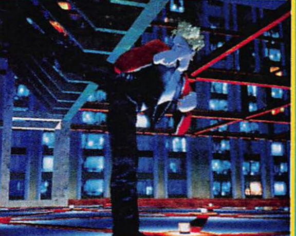
VIRTUA FIGHTER 3