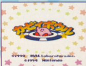
(ABOVE) Jass Kirbby! It issa!!! He's great insee! I love you Kirby!