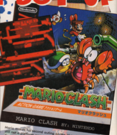
MARIO CLASH BY: NINTENDO

Mario makes his second outing on the Virtual Boy and - gasp! - it's still not a platform game. Well, not quite. You see Mario Clash is a three-dimensional version of the single-screen shell-chucking sub-game on Mario All-Stars or, if you're a real old chuffer, Mario Bros on the NES. It was never the most interesting of the Mario games and the updated Mario Clash has done precious little to help matters, despite the addition of some pretty cool 3D.