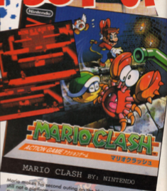
MARIO CLASH BY: NINTENDO

Atlus are a bit of an unknown quantity over here, although they've been producing quality games in Japan for some time now. This one's not bad either although, like so many VB games, it doesn't really show off the VB's capabilities. The game itself is a sort of Gauntlet clone, with the player controlling one of three characters whilst exploring a baddy-infested maze viewed from overhead. As each maze is completed the action moves to the level below where even nastier nasties and bossier bosses await.