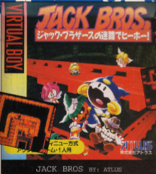
JACK BROS BY: ATLUS