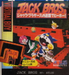
JACK BROS BY: ATLUS

Atlus are a bit of an unknown quantity over here, although they've been producing quality games in Japan for some time now. This one's not bad either although, like so many VB games, it doesn't really show off the VB's capabilities. The game itself is a sort of Gauntlet clone, with the player controlling one of three characters whilst exploring a baddy-infested maze viewed from overhead. As each maze is completed the action moves to the level below where even nastier nasties and bossier bosses await.