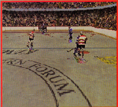
NHL All-Star Hockey