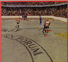
NHL All-Star Hockey